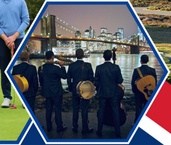
THE LONDON ESSENTIALS