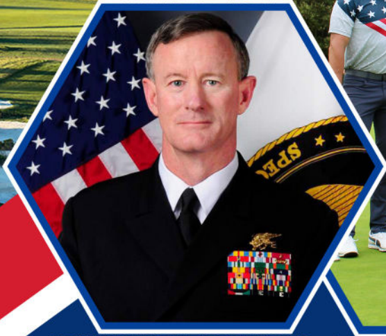
ADM WILLIAM H. MCRAVEN (Ret.)